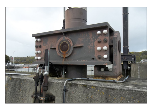
Fishbourne Ferry Port - Condition of existing gimbal showing wear and corrosion

All operations during this contract were implemented successfully by USL Ekspan, on time and with no disruption to ferry services, even with the challenges of working with limited access and within confined spaces.