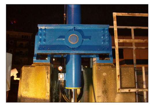
Portsmouth Ferry Port - New gimbal installed