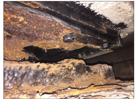
Existing bearing showing delamination and corrosion before removal

Manchester City Council employed USL Ekspan to carry out works, overdue at the time, on the remaining 2 bearings located on the underside in the abutment chamber.