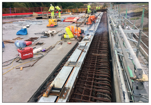
Joint steel rails welded into position for the T-Mat 80 expansion joint to be installed